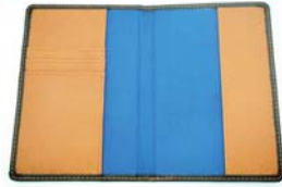
Passport Holder Material: PU Leather Technique: combination of different colour materials Size: 135 x 95mm