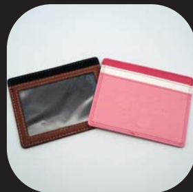
PU Card Holder #2

Size: 106 x 81mm Design: 1 pocket (front) 3 pockets (back)