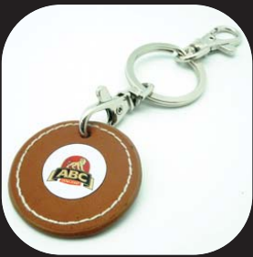
Keychain Material: PU Leather + Metal Size: 40mm dia.