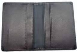
Passport Holder Material: PU Leather Technique: logo embossing Size: 135 x 95mm