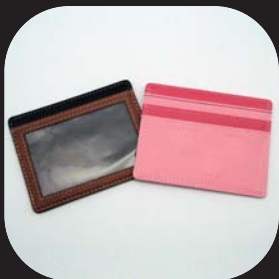
PU Card Holder #1

Size: 106 x 81mm Design: 1 pocket (front) 3 pockets (back)