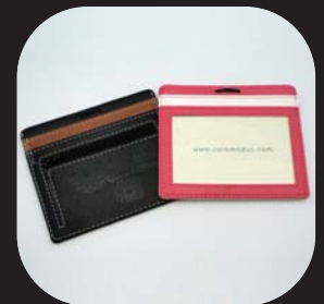
PU Card Holder #3

Size: 106 x 81mm Design: 1 pocket (front) 4 pockets (back)