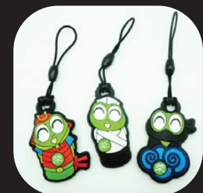
Mobile Phone Charm

Material: Soft PVC, Rhine stones Size: 100 x 120mm