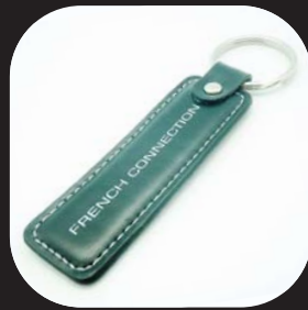
Keychain Material: PU Leather Finishing: silk screen Size: 80 x 20mm