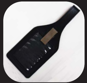
Keychain Material: PU Leather Size: 110 x 65 mm