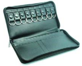
Travel Pouch Material: PU Leather Technique: logo embossing