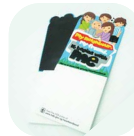
Fridge Magnet with Memo Pad

Material: Soft PVC Technique: hidden magnet Size: 80mm dia.