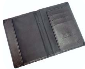
Card Holder Material: PU Leather Technique: logo embossing Size: 75 x 105mm