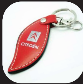
Keychain Material: PU Leather Finishing: metallic print Size: 60 x 25mm